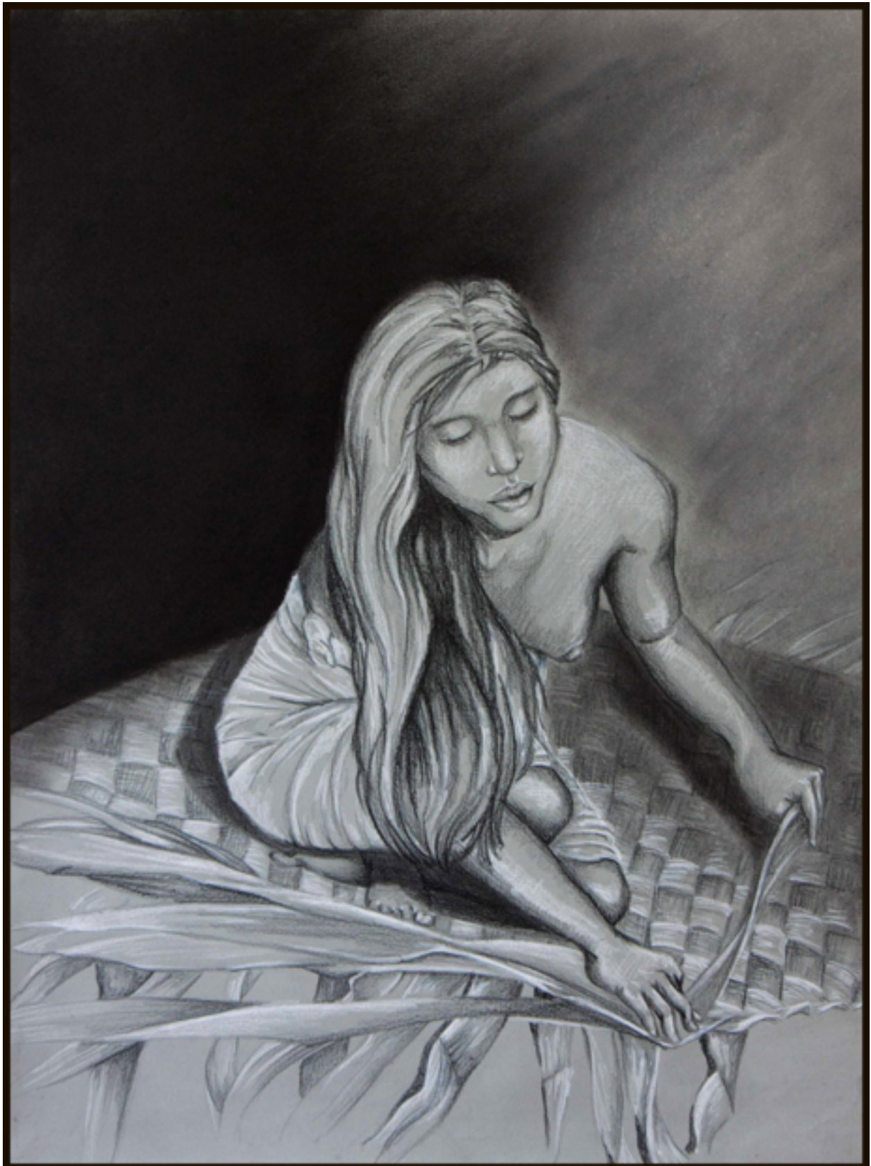
Outer Island Woman , Artwork © 2016, Yvonne C. Neth