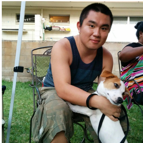
Media Volunteer, ysuenaga@hawaii.edu