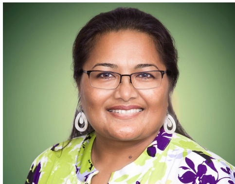
Program Director, josie@weareoceania.org